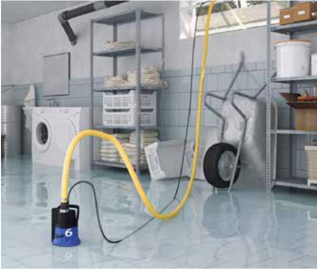
Always at hand in case of flooding in the cellar