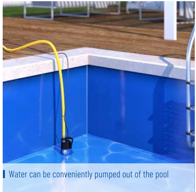
Water can be conveniently pumped out of the pool