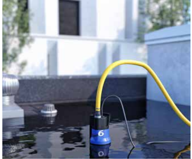
Rainwater can be quickly removed from flat roofs