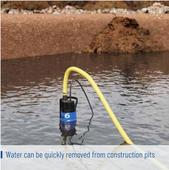
Water can be quickly removed from construction pits